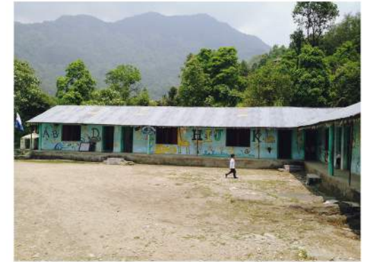
Roofs that Project Namaste V replaced