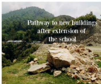
Pathway to new buildings after extension of the school