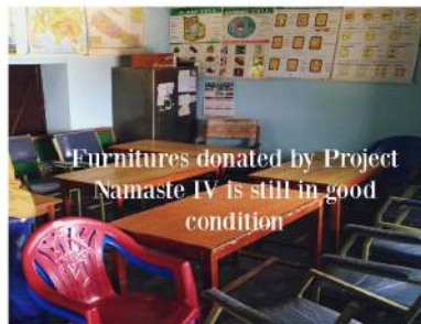
Furnitures donated by Project Namaste IV is still in good condition