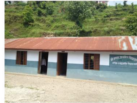
Exterior of the school building that Project Namaste painted is still in good condition