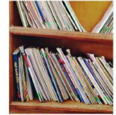
Some books that Project Namaste I donated