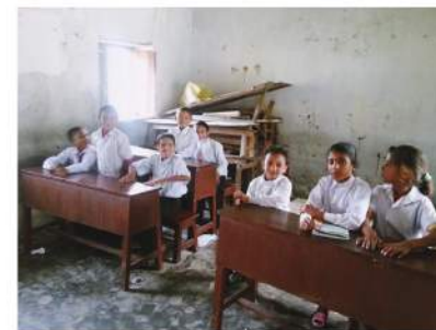
Students using the furniture that Project Namaste I donated