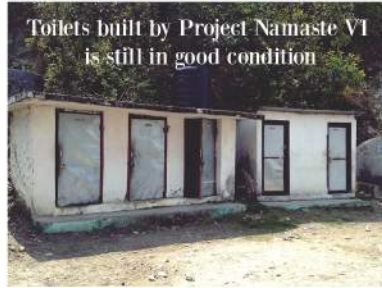
Toilets built by Project Namaste VI is still in good condition