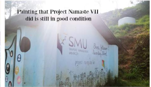
Painting that Project Namaste VII did is still in good condition