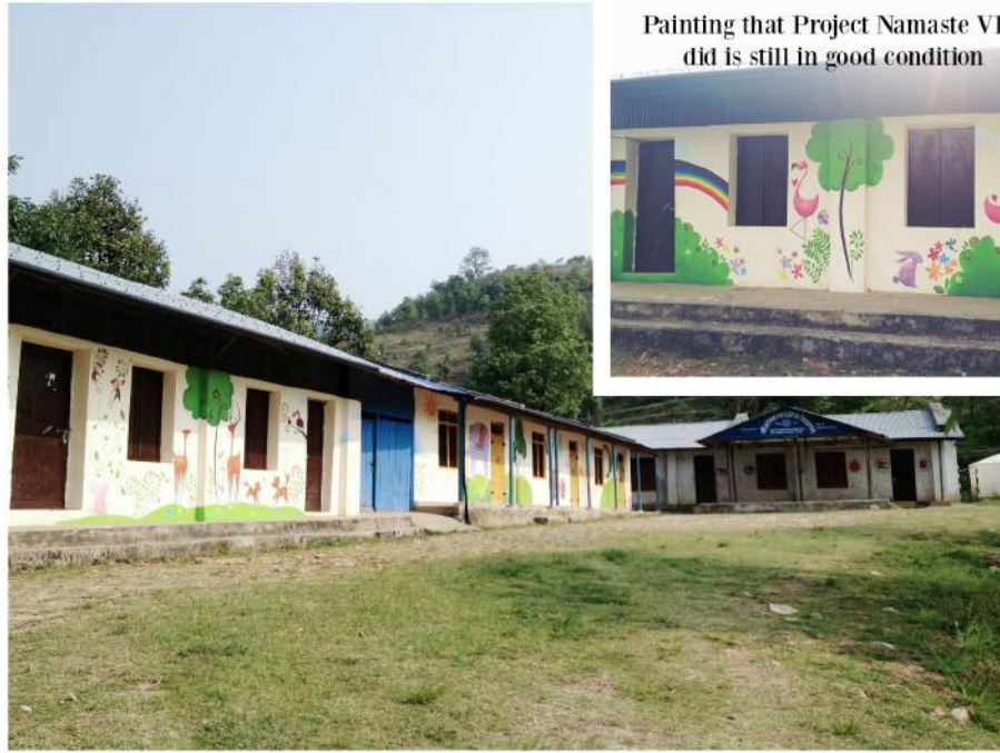
Painting that Project Namaste VIII did is still in good condition