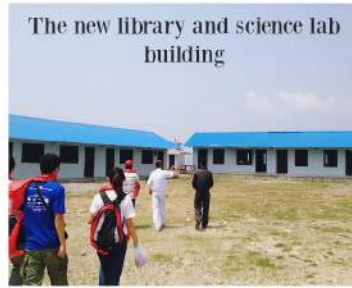
The new library and science lab building