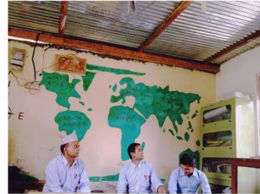
Teachers in the library the Project Namaste I painted

They want to increase security of the school by having more fences as there been theft cases and wild animals. They need more English books in the library for their students, new furniture as the current tables and chairs are worn out. The headmaster requested for printer and laptops.