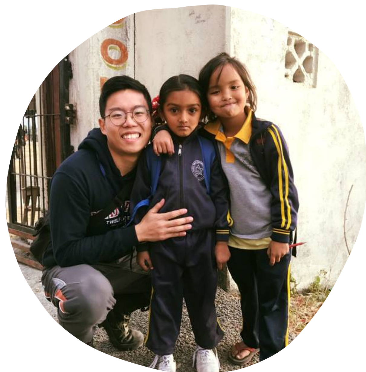
Chua Ding En Logistics

I believe that each and every person from the team of Namaste XII have been reminded, taught and understood what it is like to love the people around them. Separated from the luxuries and necessities of the city, we learn to love through the simplest of actions.